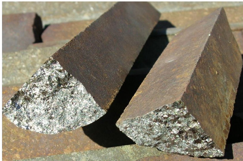
Figure 2. Massive sulphide nickel from Carr Boyd Nickel mine.

The use of modern geophysical techniques is greatly assisting the Company to gain further important data which it hopes could ultimately lead to the discovery of the source of the high tenor massive magmatic nickel and copper sulphides at the Carr Boyd Nickel project.