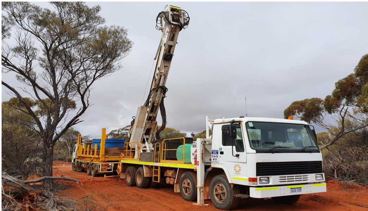
Picture 1. Diamond drill rig located over the Target 5 Ni-Cu discovery zone.

Estrella Resources Limited (ASX: ESR) (Estrella or the Company) is pleased to provide an update on the Carr Boyd Nickel Project (CBNP or the Project). The CBNP is comprised of the Carr Boyd Layered Complex (CBLC or the Complex).