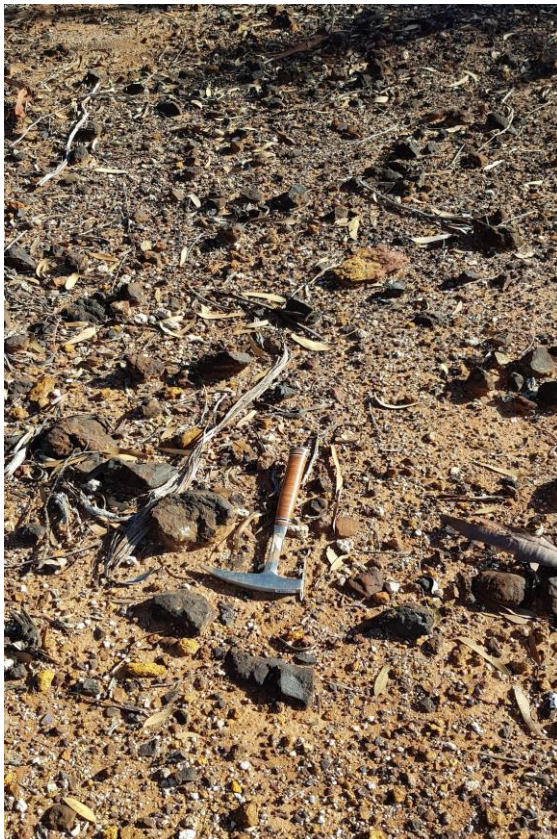
Picture 2. Ground surface at Target 5.

A “Voisey Bay” style model has not been adequately explored within the CBLC. This represents a compelling exploration target opportunity which the Company will continue to aggressively pursue.