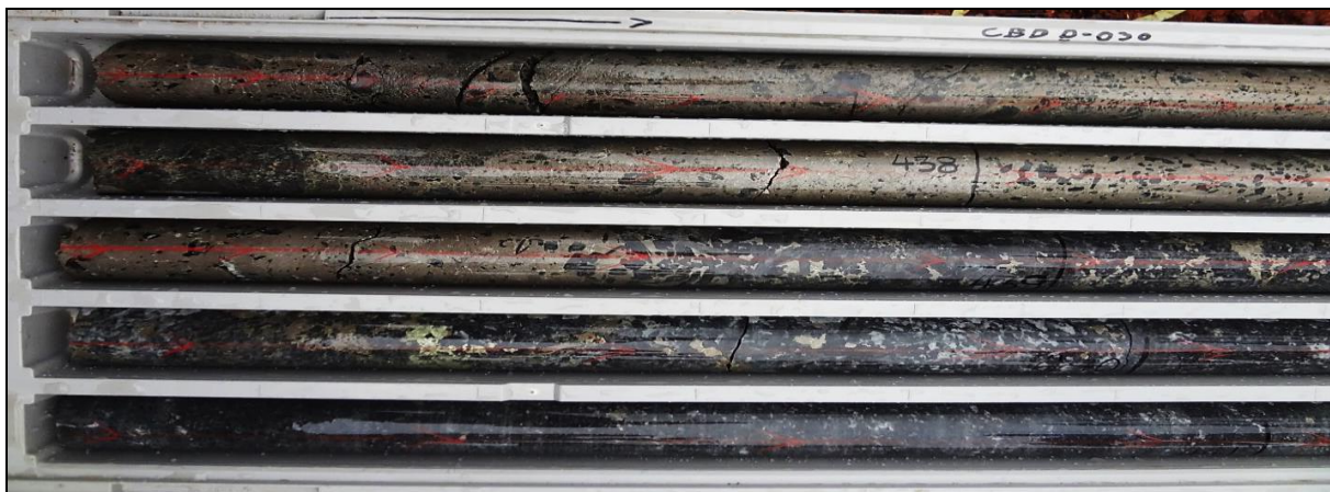
Figure 2. Unique magmatic sulphide textures showing breccia rip up clasts within the massive sulphide, interstitial sulphide/crystal intergrowth at the margin, and chalcopyrite segregation within the crystallised host gabbro. Coarse blebs of matrix sulphide are observed between the crystallising host rock (436.7m-441.1m shown).

Diamond core hole CBDD030 was collared 300m south of the T5 zone, testing the Carr Boyd Layered Intrusions contact at depth, below and south of the previously identified mineralisation. The hole successfully intersected the basal contact of the layered mafic/ultramafic intrusion, returning a significant ~15m wide zone of sulphide mineralisation starting from 430.55m downhole, and contains a 2.9m thick core zone of massive Ni-Cu sulphide mineralisation from 435.9m depth (Figures 1 & 2). CBDD030 intersected the intrusion contact at a depth of 368m, was completely blind and is open in all directions. This provides massive opportunity to drill out and expand this zone of mineralisation. The sulphide zone forms unique magmatic nickel sulphide textures comprising pyrrhotite, pentlandite and chalcopyrite (Figure 2), with assays confirming the high-grade nature of the Ni-Cu sulphides 1 .