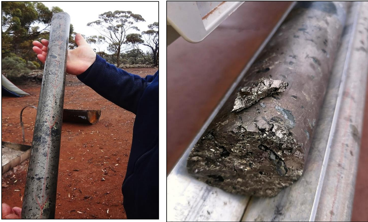
Figure 1. Ni-Cu bearing massive sulphide zone in diamond drill hole CBDD030 drilled 300m south of the T5 Ni-Cu discovery zone (436.7m-437.6m shown).

Diamond core hole CBDD030 was collared 300m south of the T5 zone, testing the Carr Boyd Layered Intrusions contact at depth, below and south of the previously identified mineralisation. The hole successfully intersected the basal contact of the layered mafic/ultramafic intrusion, returning a significant ~15m wide zone of sulphide mineralisation starting from 430.55m downhole, and contains a 2.9m thick core zone of massive Ni-Cu sulphide mineralisation from 435.9m depth (Figures 1 & 2). CBDD030 intersected the intrusion contact at a depth of 368m, was completely blind and is open in all directions. This provides massive opportunity to drill out and expand this zone of mineralisation. The sulphide zone forms unique magmatic nickel sulphide textures comprising pyrrhotite, pentlandite and chalcopyrite (Figure 2), with assays confirming the high-grade nature of the Ni-Cu sulphides 1 .