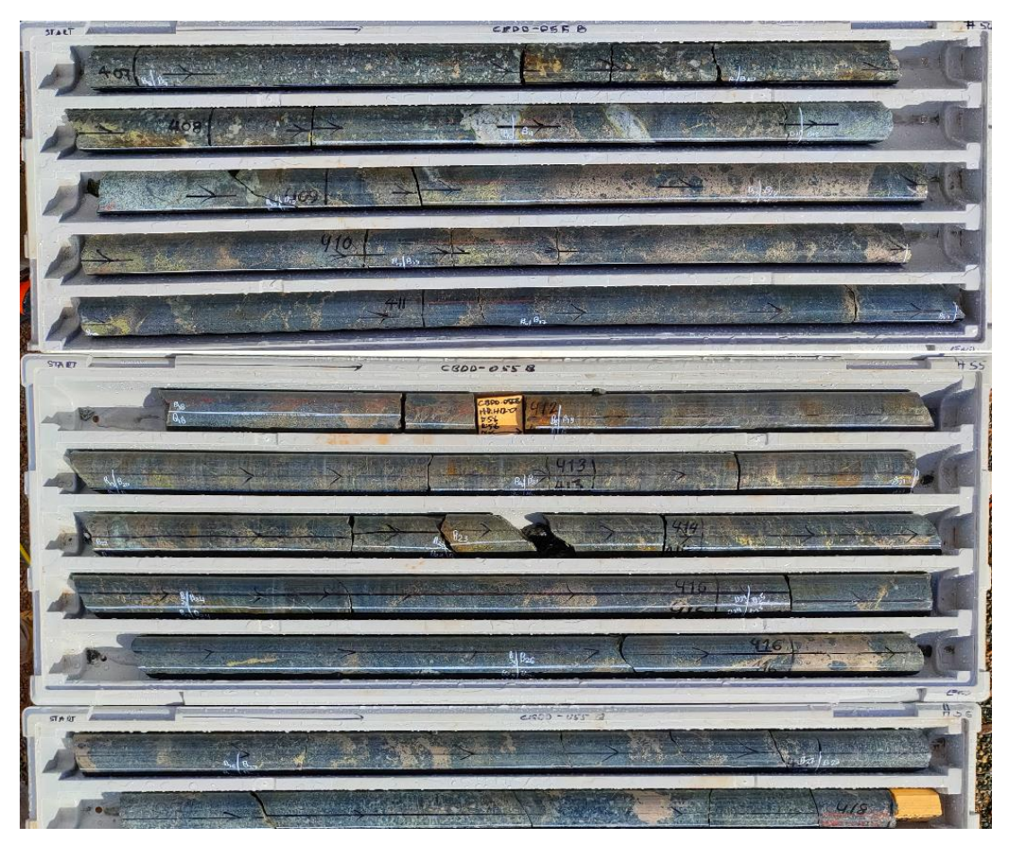
Figure 1: Massive to globular nickel-copper-iron sulphides in diamond drill hole CBDD055B at 407m to 418m.