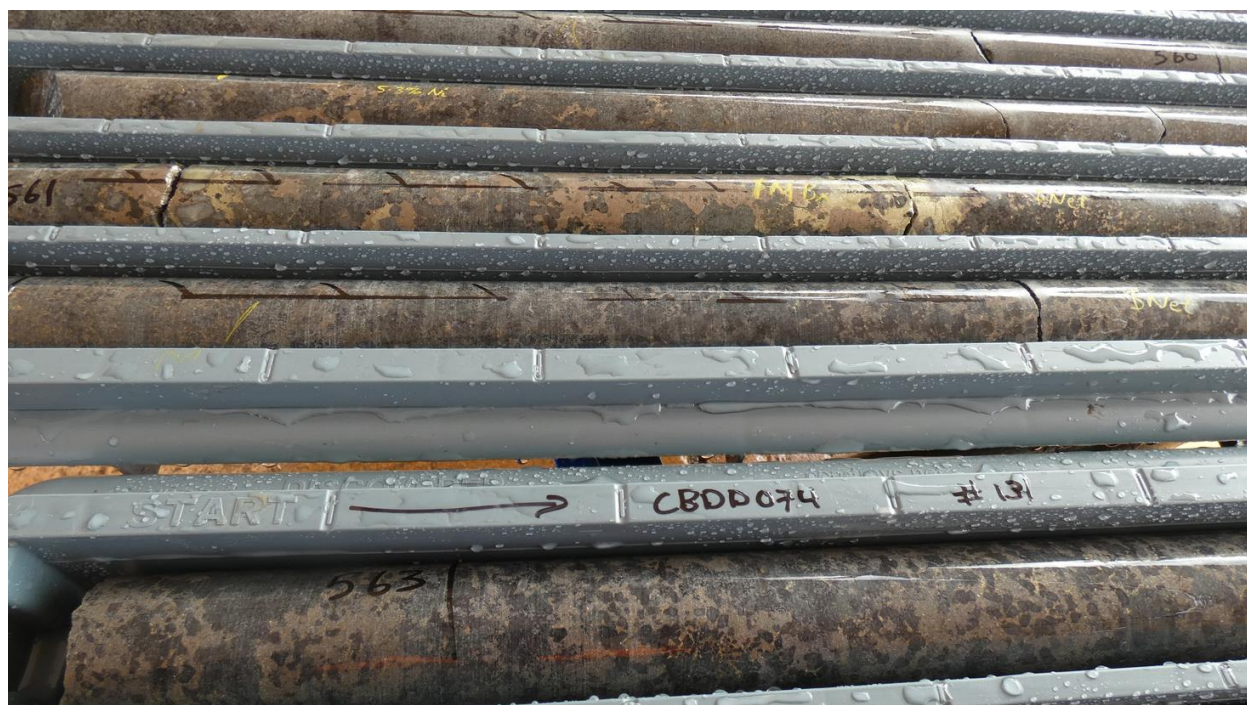
Figure 3: Breccia and matrix semi-massive nickel & copper sulphides from CBDD074 around 361m downhole depth

Once hole CBDD074A is complete, the next step-out holes will be collared, targeting T5 extensions 100m to the South, particularly the deeper DHTEM plates identified from the recent survey of CBDD067.