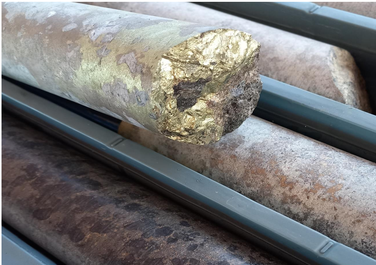
Figure 1: Matrix of copper and nickel sulphides from approximately 561.45m downhole CBDD074

10.7m of disseminated to semi-massive sulphides from 559.6m