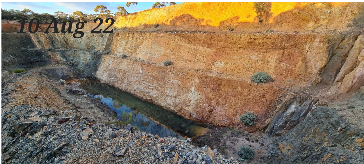
Figure 1: Spargoville 5A Open Pit Nickel Mine as at 10 th August 2022

* Down hole widths quoted. For true widths refer to Table 1