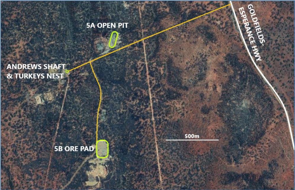
Figure 3: Areal view of the Spargoville Project and location of infrastructure

With the completion of the Goldfields-Esperance Highway upgrade, the Main Roads Contractor has handed over control of key infrastructure to Estrella. This includes a one million litre lined and fenced dam (turkey's nest) at the Andrews Mine and a cleared, 5-acre pad at the 5B Nickel Mine. Both these are critical infrastructure that enable the fast-tracking of the bulk sample acquisition in October. Figure 3 shows the close location of these assets with respect to the 5A Open Pit.