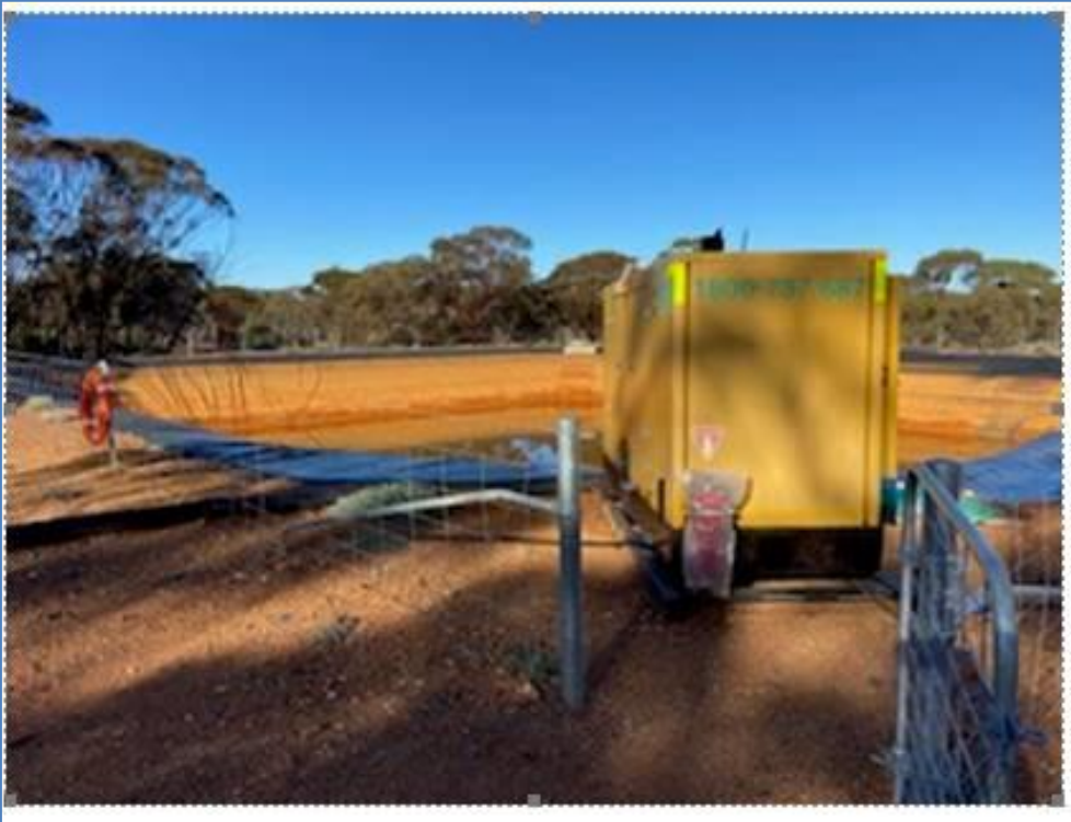
Figure 4: Turkey's nest located at the Andrew's Shaft providing readily available water source